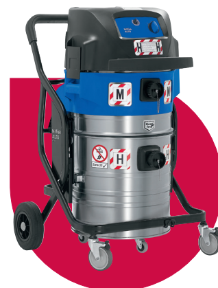
ATTIX 995-0H/M SD XC TYPE 22

Nilfisk-ALTO offers a range of safety vacuum cleaners to pick up explosive dust and separate it from the surrounding air. If dusts are to be vacuumed which are both explosive and hazardous, these vacuums can meet the requirements for both.