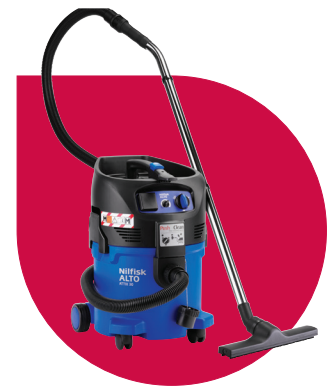
ATTIX 30-2M PC

Reduce cost with the washable PET Fleece filter element eliminating unwanted cleaning interruptions of work and to ensure consistently high suction performance and low maintenance costs.