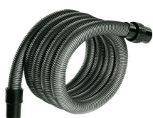
Suction hose - Ø 36 mm • Antistatic, Ø 32 mm, 5 m, with tool adapter