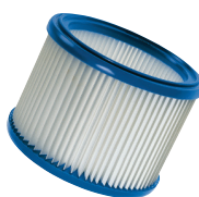
Filter Element Filter element with high filtration efficiency ensures a pleasant air.