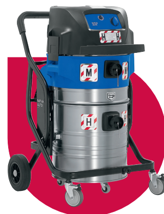
ATTIX 965-0H/M SD XC

All H-class machines are supplied with a filter individually tested and certified. Depending on your cleaning requirements you can choose from various product characteristics such as different container sizes, soft start, manual filter cleaning and much more.