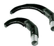
Pipe cleaning nozzles For external cleaning of pipes with a diameter 70-120 mm and tubes with a Ø 120-200 mm