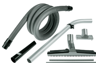
Industry Set 6 parts Ø 50 mm inc: Suction hose 4 m, curved 1m anodized aluminum extension tube, Industrial floor nozzle - aluminum, Replacement rubber lips, Special plastic crevice nozzle, Coarse dirt nozzle - aluminum